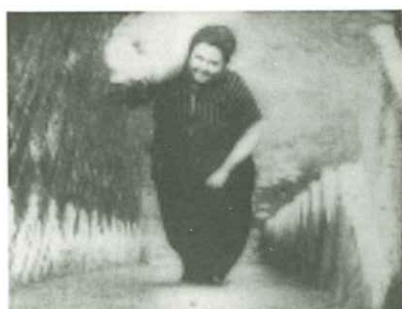
Fig. 4a. Detail of fig. 4.

the point of exasperation. In order to ›time‹ it properly, I got together a group of workers and people in the neighborhood, and I studied the effect that was